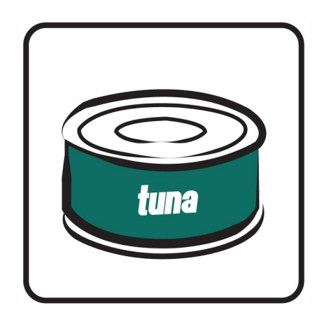
TUNA, SALMON, SPAM, CHICKEN, HAM