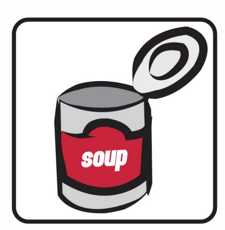
MAC & CHEESE, CHILI, STEWS, MEAT Y SOUPS, FRUITS, VEGETABLES