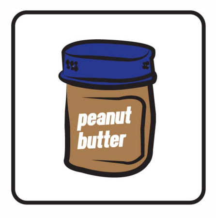
PLASTIC JARS ONLY