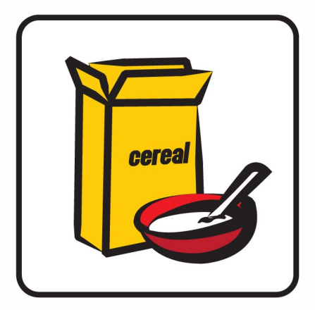
PASTA, POTATOES, RICE, CEREAL